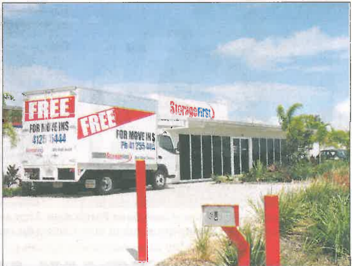
Storage First is located on Southern Cross Circuit, Urangan, and offers complete storage needs for every local requirement.

out of home and making a start on their own lives she had the time to return to work.